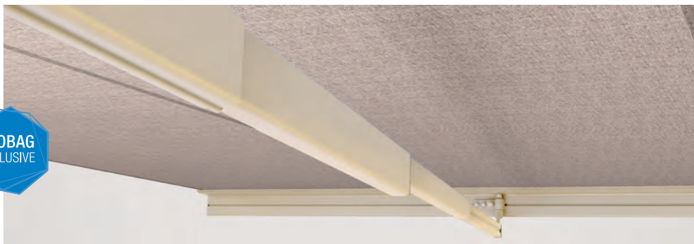
Telescopic arm technology